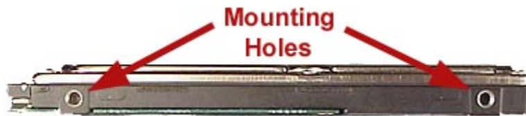
Figure 2.HDD Mounting Holes