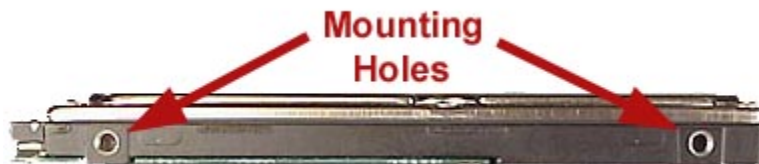
Figure 2.HDD Mounting Holes

Important Note: Disconnect power from your computer system before beginning installation.