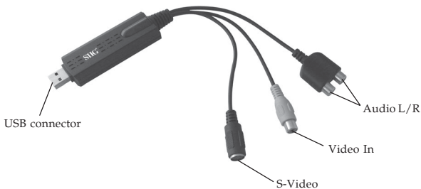
Figure 1: Layout

Note: When using the S-Video connection, you must also connect Audio L/R to hear the sound.