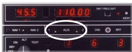
AUX 1 & 2 toggle switches

The AP-3000 is designed to be similar in operation and function to common avionics stacks found in actual aircraft. With few exceptions, its use should be intuitive and integrate easily with any system. A few functions unique to the AP-3000 are the AUX 1 & AUX 2 toggle switches (pictured below). AUX 1 is an ON/OFF style switch that controls the display of the on-screen Moving Map. AUX 2 is used for DME selection in the King Air.