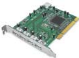
Maxtor USB 2.0 PCI Adapter Card K01PCUSB2

*Upgrade to USB 2.0 performance with a Maxtor USB 2.0 Adapter Card (optional)