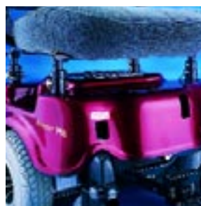
On-board battery charger means easy charging.