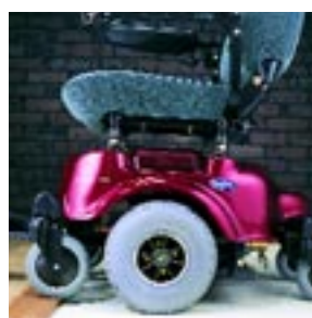
Six wheels on the ground for easy and stable driving over most thresholds.