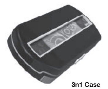
Hard outer covering and fitted inner lining provides twice the protection