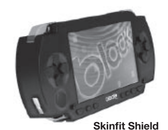
Provides protection, comfort and access to all ports and buttons