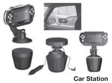
Mounts on any flat surface for the person on the go