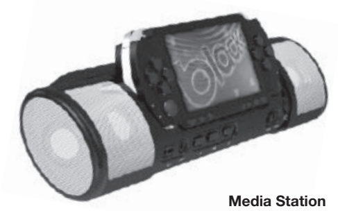
Portable compact design transforms into a multi media system