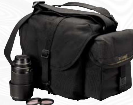
700-J3B – Black Ballistic Nylon

Surprisingly roomy for it's size this compact bag carries more equipment than you would expect.