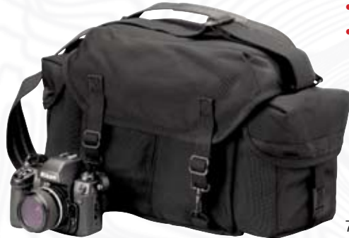
700-J2B – Black Ballistic Nylon

Similar to the J-1 in form and function, the J-2 is slightly smaller in length and height to accommodate a little less gear.