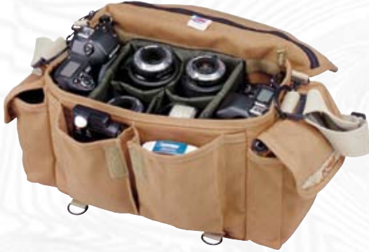
Domke F-2 with one 4-section insert