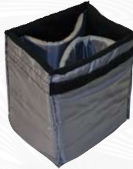
720-2JM • 6.5" W x 7.75" D x 8" H

Fits 1 camera body or 2 lenses and 2 flashes or a combination.