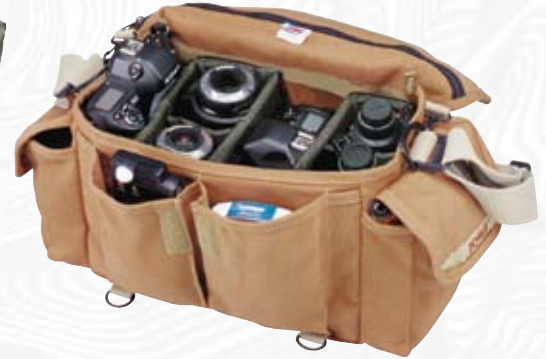
Domke F-2 with two 2-section inserts

Soft Side Construction and Customizable Inserts Allow You to Fit More Equipment Into Less Space.