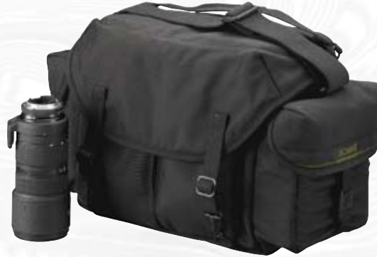
700-J1B – Black Ballistic Nylon

The largest of the Journalist series, it can hold a large diverse assortment of camera gear.