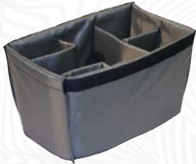
720-250D • 6.25" W x 11.5" D x 8" H

Great for a DSLR with short lens plus 2 lenses and 2 flashes.