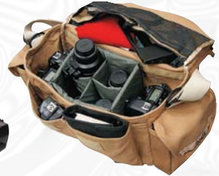
Domke F-1, with 4-section insert holds all this... with room for more!