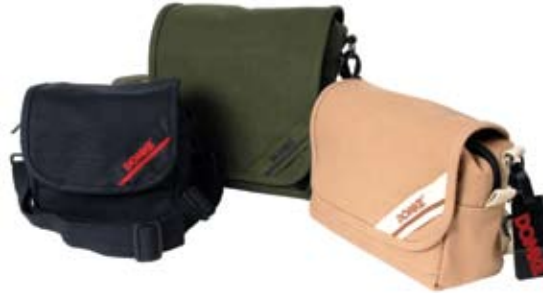
All Domke Classic Bags Available In These 3 Colors

Domke shoulder bags are unlike other bags because of their flexible design and lack of bulk. There are no thick walls and heavy foam or space wasting padding in a Domke bag. This means you can fit more equipment in less space and the bag hugs your hips instead of bouncing against them.