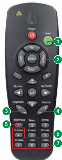
EP7155 Remote Control