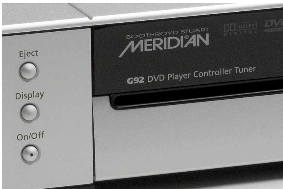
G92 features a slot-loading DVD-ROM drive

The HDMI output can be connected to a DVI input if the device supports HDCP copy protection, using a suitable adaptor cable.