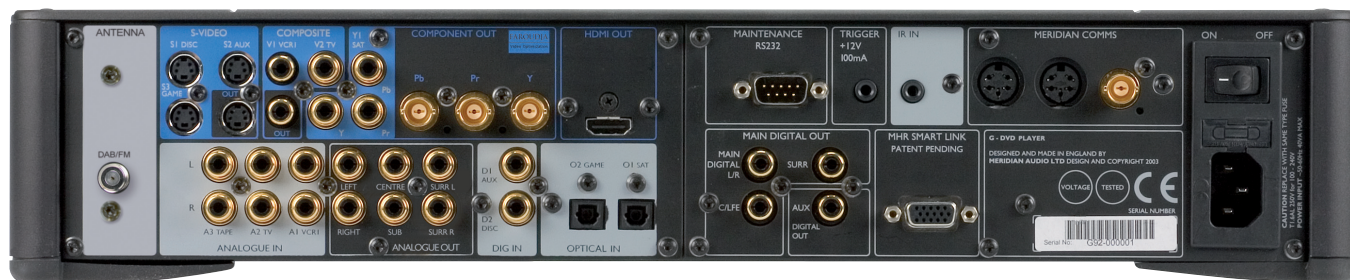
G92 DAB rear panel

In addition, the G92 incorporates digital surround decoding to allow the multichannel analogue and digital outputs to be used to drive a 5.1 surround system directly, based on Meridian DSP Loudspeakers and/or conventional analogue amps and speakers.