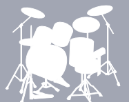
Acoustic Drum Set + RT-7K / RT-5S / RT-3T