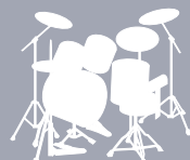
Acoustic Drum Set + RT-7K / RT-5S / RT-3T