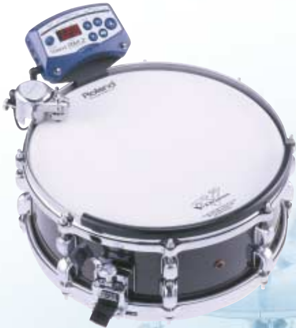
*RM-2 and Snare Drum not included.

With the PCK-1 Practice Conversion Kit, you can turn your acoustic snare drum into a near-silent practice pad. This special package includes a patented 14-inch mesh head, an acoustic trigger with separate head/rim capabilities, and a rim silencer so you can practice naturally without disturbing others. Add an optional RM-2 Rhythm Coach training module for even more effective practice.