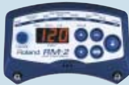
RM-2 Rhythm Coach

Want to get more out of your practice sessions? Then add the RM-2 Rhythm Coach! This combination sound module/metronome takes the monotony out of practice with 28 realistic drum sounds and 11 onboard rhythm training exercises. The RM-2 mounts easily to the PCK-1 with the included bracket.