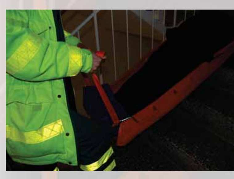
The operator on the head end holds against any pull at the same time that he lightly lifts, so that the patient's head won't hit against the steps.