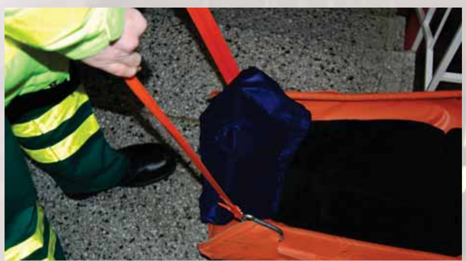
When the patient is secured on the Emergency Mattress the transport can begin.

Both operators should hold the orange straps with a firm grip (adjust the grip and position for the best ergonomic position). The operator on the foot end backs down at the same time as he holds the mattress by lifting lightly.