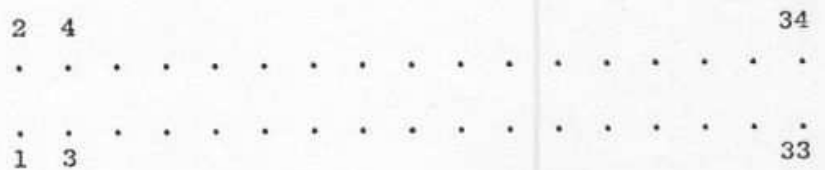
Diagram 2 : PIN CONNECTIONS OF THE THE DISK DRIVE CONNECTOR . ( SKETCH OF FRONT VIEW )

0V --1 2-- 0V --3 4-- 0V --5 6--Disk drive D 0V --7 8--Index 0V --9 10--Disk drive A 0V --11 12--Disk drive B 0V --13 14--Disk drive C 0V --15 16--Head Load( Motor on) 0V --17 18--Direction 0V --19 20--Step 0V --21 22--Write Data 0V --23 24--Write Gate 0V --25 26--Track 00 0V --27 28--Write Protected 0V --29 30--Read Data 0V --31 32--Side 1 0V --33 34--