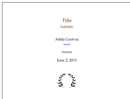
(a) Title page

Find some screenshots using brown highlight fonts below.