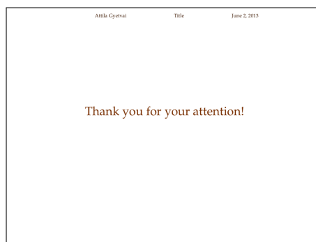
(c) "Thank you" slide