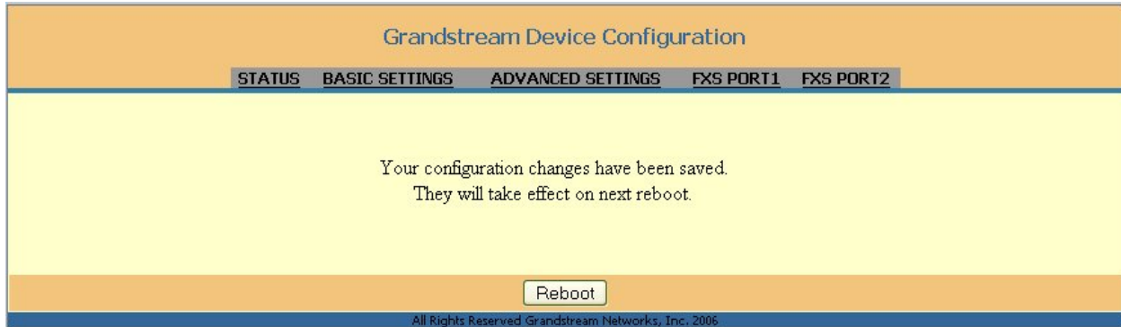
Figure 4: Screenshot of Save Configuration Page