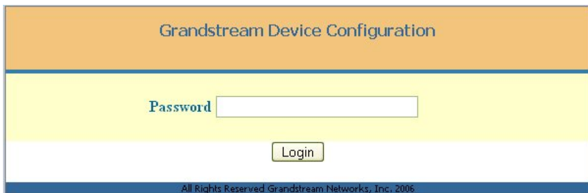
Figure 3: Screenshot of Configuration Log in Page

NOTE: If you cannot log into the configuration page by using default password, please check with the VoIP service provider. The service provider may have provisioned and configured the device for you. The Basic Configuration Page is the first web GUI the user will see.