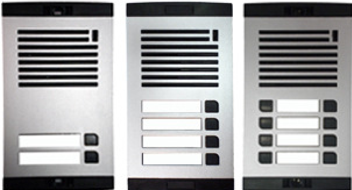
Figure 1: Enclosures options