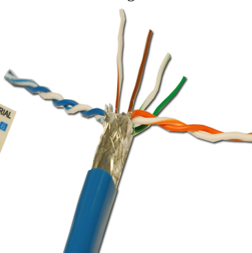
Wires Cut on Angle