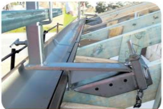
TYPE 6: TILE ROOF WITH EAVES