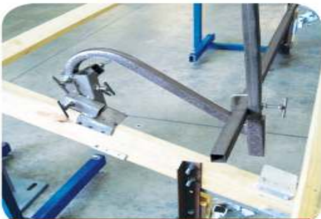
TYPE 5: Z BEND WITH EAVES