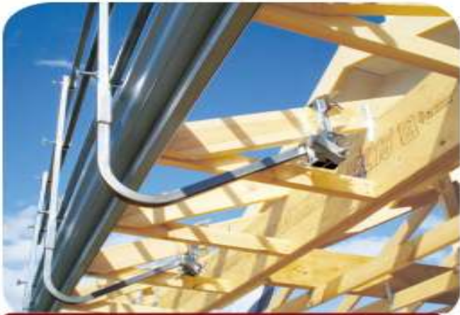
TYPE 1: L BEND EXPOSED EAVES