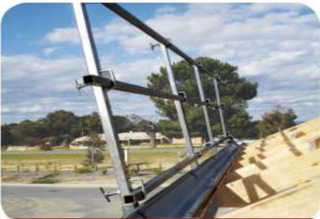
TYPE 3: IRON ROOF