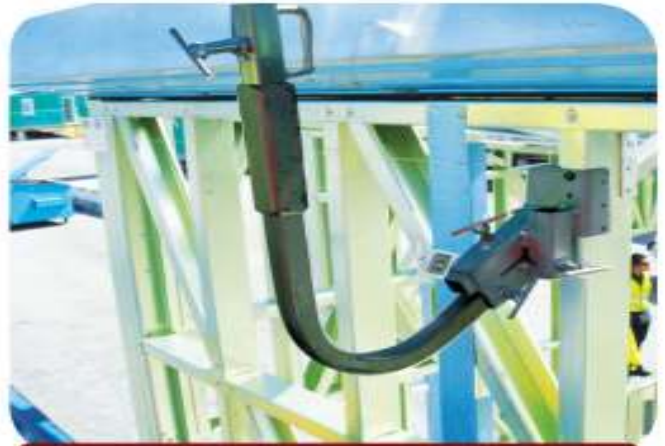
TYPE 2: WALL STUD WITH