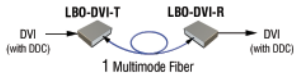
Figure 2-1 LBO-DVI Setup

The BCI LBO-DVI Series units are used in pairs. One LBO-DVI-T transmitter unit is located at the near-end (source) and connected through one optical fiber, to the LBO-DVI-R receiver located at the far-end (sink) of the link. Figure 2-1 depicts a typical installation for the LBO-DVI-T/R.