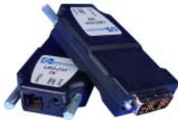
Figure 1-1 LBO-DVI TX and RX View