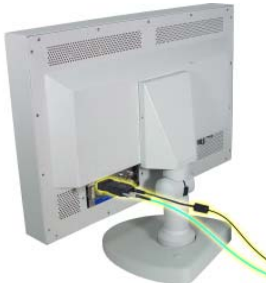
Figure 2-2 Electrical Connection