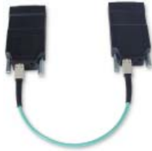
Figure 2-3 Fiber Optic Connection