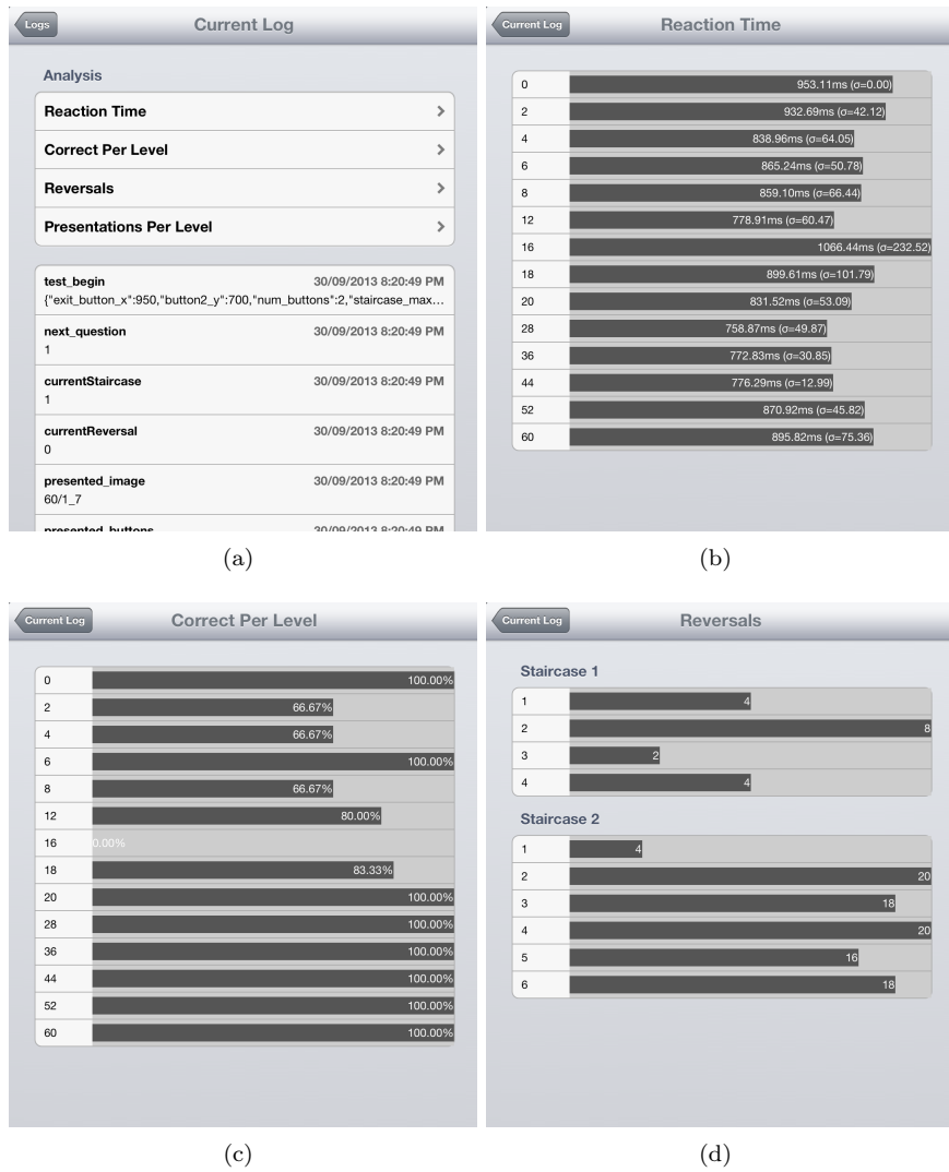
Figure 4: Overall structure of data in PsyPad. An administrator owns an image library and a list participants. Each entry in the image library is a zip file of images as per Section 8. Each participant has a list of test configurations named “Test x ” in this figure (see Section 9), and log files of previous tests (Section 12). Each test configuration uses one of the image sets in the library. The group of enabled test configurations for each participant make up a session.