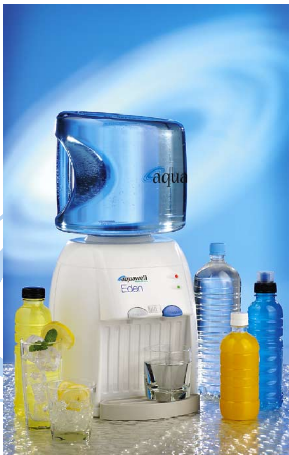
Mini Cooler AWB-MCR AWB-MHC

Please read this manual carefully before using the machine Ensure the manual is kept in a safe place for future reference