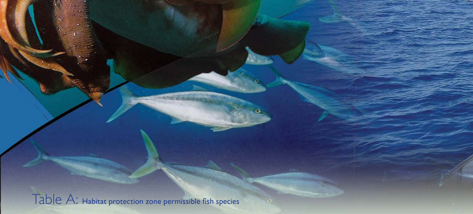
Table A: Habitat protection zone permissible fish species