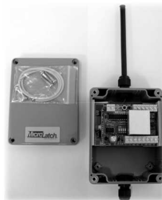
IP65 Version ( Outdoor ) REC-14 IP65