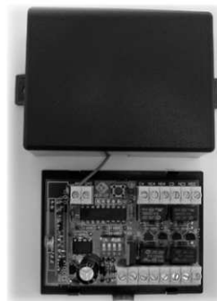
Standard Version ( Indoor ) REC-14