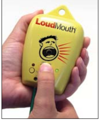
Swith the unit "ON". The green light should be lit.

6. Press the TEST button to simulate a damage condition before beginning work and anytime during installation if desired to confirm LoudMouth operation.