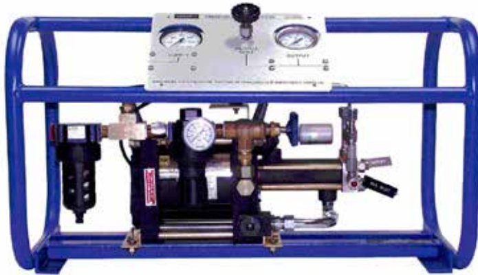
Figure 2 - Model 75