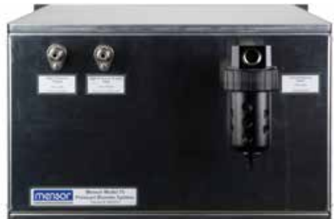
Figure 3 - Model 75 Rack Mount (front and rear view)