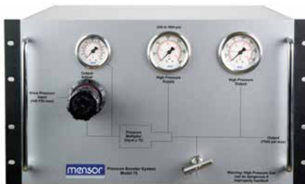
MODEL 75 RACK MOUNT (PN 0017246001)