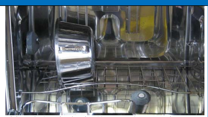
2. Lower horizontal rack and position pot over jet - note angle. Maximum 1 pot per load.