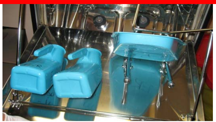
2. Position bedpans with contents on hooks as illustrated. Slide urinals over jets so clip catches. Close door & contents will empty automatically.