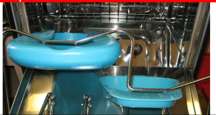
1. Flip horizontal rack up as shown above. Pull bedpan rack on door until spring locks rack in place.