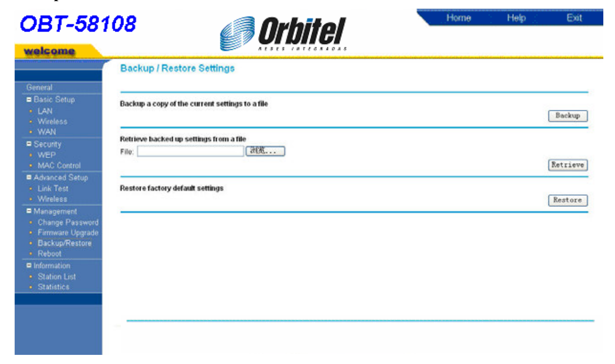
Picture11 Backup/Restore Settings

This page allows you to back up the Wireless Outdoor Bridge's current settings and restore the factory default settings.