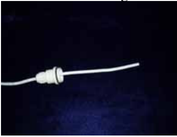
Put UTP cable through the water-joint

Make the crystal head (not cross-over cable): white orange | orange | white green | blue | white blue | green | white brown | brown