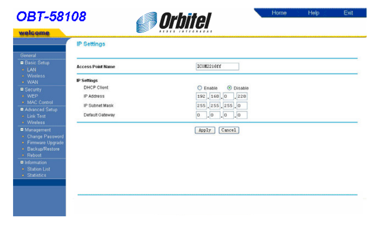
Picture3 IP Settings

The default values are suitable for most users and situations.