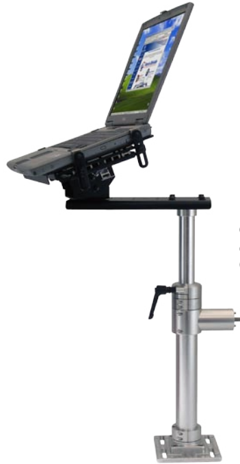
C-PED1612-W4 model shown with optional universal laptop mount C-3090-3