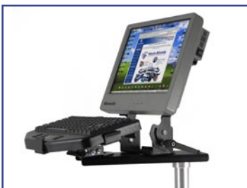
Perfect for mounting laptops or 2 & 3-piece modular computer workstations.