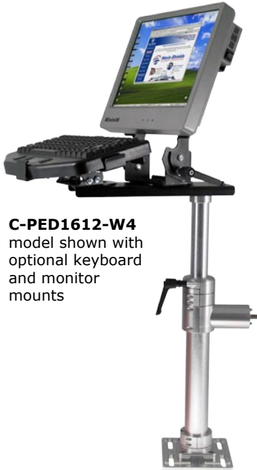
C-PED1612-W4 model shown with optional keyboard and monitor mounts