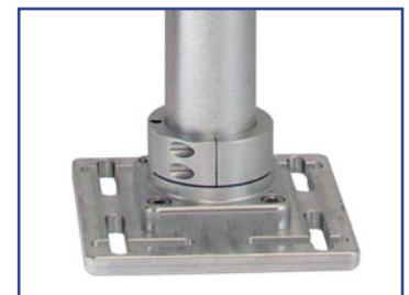
Optional (C-PED-PLT) 5.5" Square base plate with universal slot pattern for easy mounting

Call Today for Quick Delivery 1-800-524-9900 or visit www.havis.com