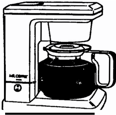
TR10 10 cups