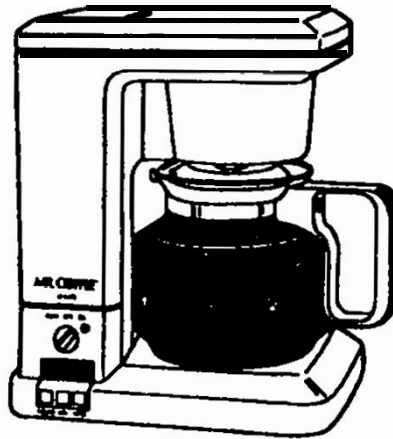
TRX20 12 cups

IMPORTANT: Please Read Before First Use The clock on the TRX20 model must first be set, before the coffeemaker will operate.