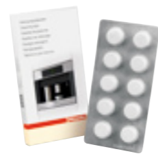
Original Miele cleaning tablets

Suitable for all Miele coffee machines, required for optimum descaling of the water carrying parts, to be applied as prompted by the machine (intervals depending on water hardness)