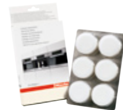
Original Miele descaling tablets

Suitable for Miele freestanding coffee machines. Keeps milk fresh and cool for longer, holds 0.5l