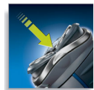
Reflex Action system