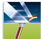
Super Lift & Cut technology