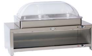
Model CMLB-C2RT Warming Cabinet with Buffet Server with Low Profile Roll-top Lid