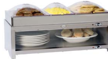
Model CMLB-CSLP Warming Cabinet with Mid-Size Buffet Server (plates not included)