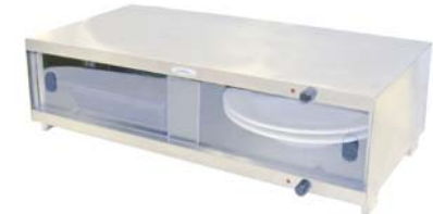
Model CMLW-C Warming Cabinet with Mid-Size Warming Tray (plates not included)