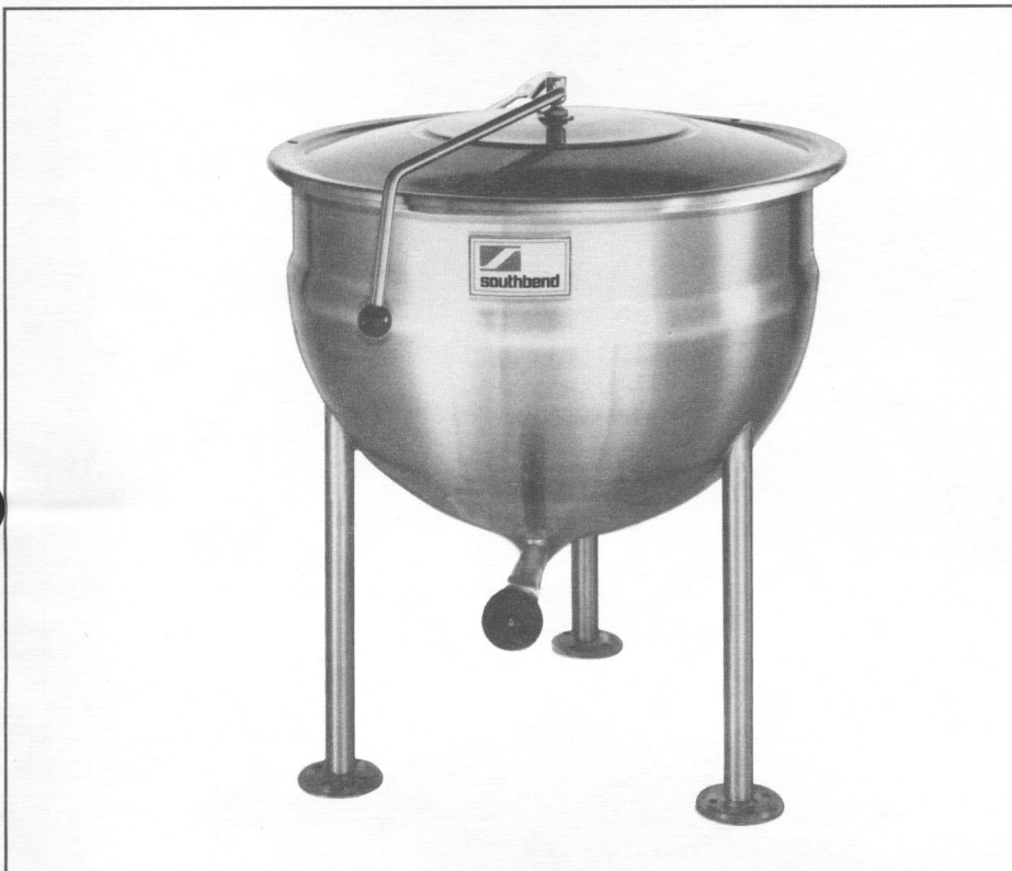
Model KDLS-40F (with 1½ draw-off and hinged lid as standard)

MODELS: 20 Gallon (76 Liter) 30 Gallon (114 Liter) 40 Gallon (151 Liter) 60 Gallon (227 Liter) KDLS-20F KDLS-30F KDLS-40F KDLS-60F