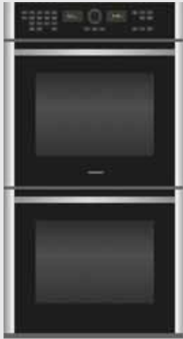
iSlide™ Convection Electric Double Oven