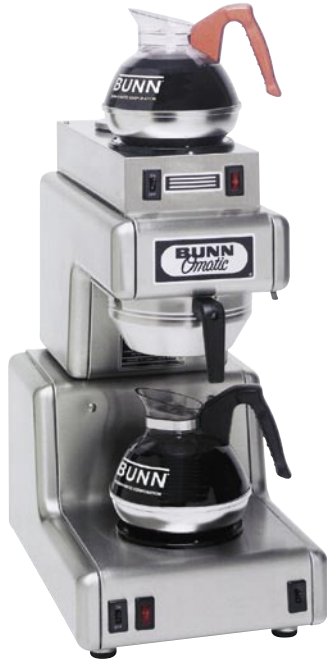
Model OL (2 warmers)