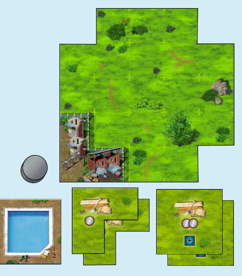
Each player takes 1 coin, 1 water zoo board, 1 depot board, 2 small expansion boards, and 2 large expansion boards, placing them in his play area.

Before the first game, carefully remove the tiles from their frames.