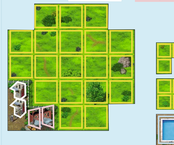
A small expansion board with 3 spaces and a large expansion board with 4 spaces for animal tiles. A depot board for all surplus tiles.

A water zoo with 19 spaces for animal tiles (on the board the corners of the spaces have bright crosses). In addition, there are 2 checkout booths and 2 feeding stations.