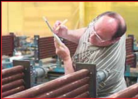
On-site state inspectors