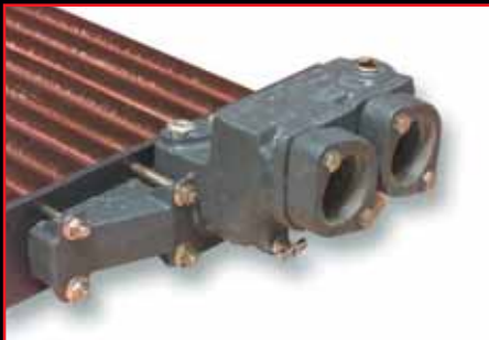
Cast iron headers