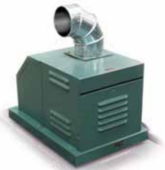
D-2 Power Vent

Using the Raypak-supplied adjustable 90° elbow, the flue gases may be discharged in any direction (see D-2 Power Vent manual for details). The D-2 Power Vent is also dual-voltage capable (120/240 volt) and engineered for long life and smooth operation.