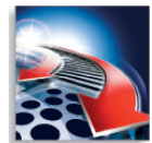
Precision Cutting System