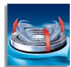
Individually floating heads