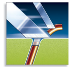
Super Lift & Cut® technology