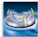
Individually floating heads