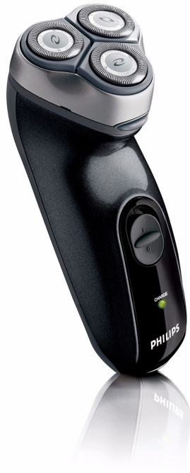
Philips electric shaver