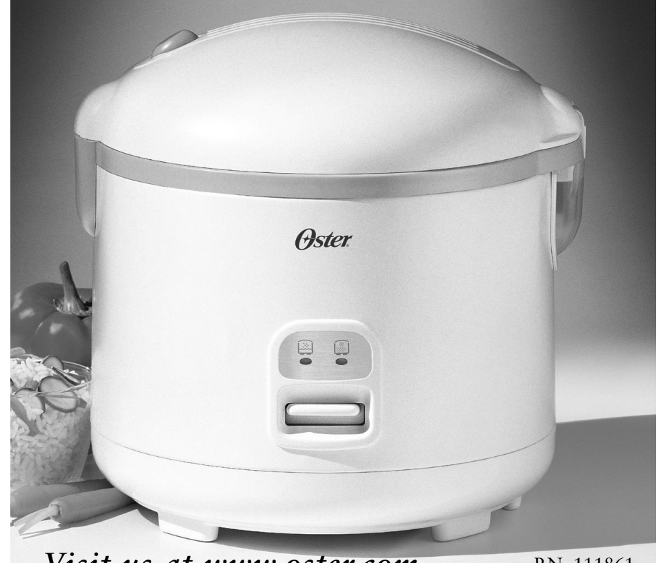
Visit us at www.oster.com