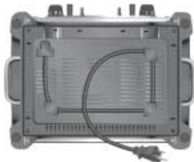
Model KPTT890 4-slice Toaster