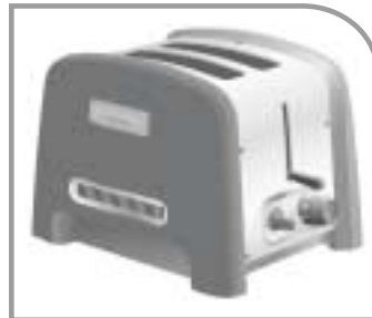
Model KPTT780 2-slice Toaster