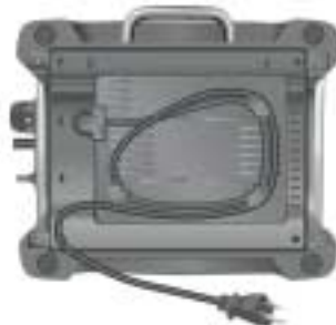
Model KPTT780 2-slice Toaster