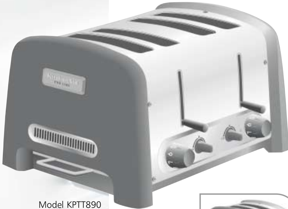
Model KPTT890 4-slice Toaster