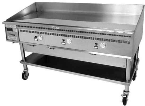
*Stand with casters or 4" legs are optional

The Keating MIRACLEAN® Griddle is designed to provide maximum performance with many benefits to the operator. The mirror surface of the MIRACLEAN® is achieved in a special eight step process. High input burners rated at 30,000 BTU/hr. for natural gas are mounted every 12" to ensure performance and recovery allowing the operator to use zone cooking for different products.