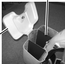
FIGURE I Using the Lockable Front Box