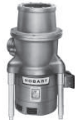
FD-500 (5 H.P.)