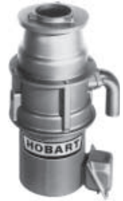
FD3-50 ( ½ H.P.) FD3-75 ( ¾ H.P.) FD3-125 (1¼ H.P.) Shown with short upper housing.

Specifications, Details and Dimensions on Reverse Side.