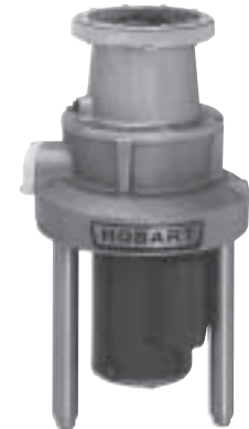
FD3-150 (1½ H.P.) FD3-200 (2 H.P.) FD3-300 (3 H.P.)