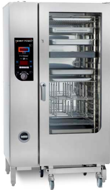
SmartCombi model ESC-220

The ESC/GSC-220 has a capacity of (20) full-size sheet pans on grids or (40) full-size steam table pans, 2 ½ in. (65 mm).