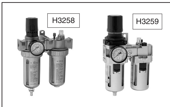
Figure 3. Models H3258 & H3259 Filter/Lubricator/Regulators.

These units are indispensable for prolonging the lifespan of your air tools. Filter keeps water/rust out. Lubricator features adjustable automatic lubrication. Regulator allows you to control the optimum PSI delivery for each air tool. Maximum pressure for each unit is 150 PSI.