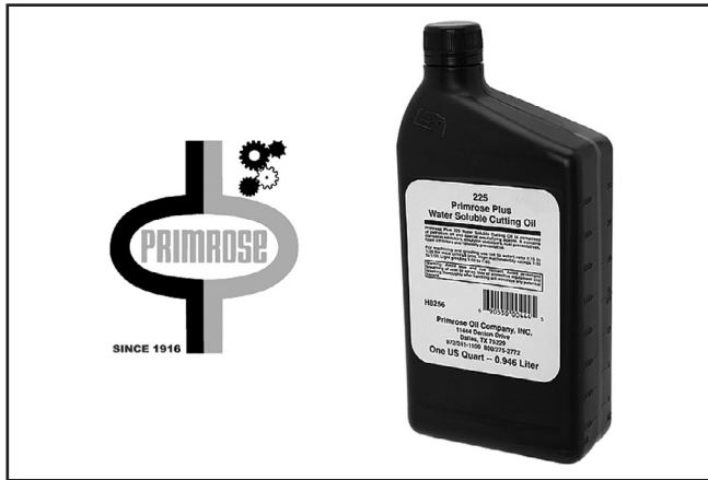
Figure 2. Primrose Water Soluble Cutting Oil.

Increases tool life with superior lubricity, maximum cooling and anti weld properties. No undesirable fumes, smoke or fog. Prevents growth of bacteria in cutting fluid dilutions. Provides a better finish to special alloys, even at higher speeds. Thin film of oil protects metal, yet requires no de-greasing before painting. Eliminates rust in equipment and on finished parts. Simply dilute with water—ratio based on metal machineability, tool set-up, feed and speed.