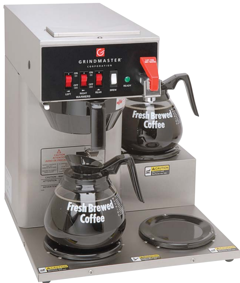
Model AT-3WR (decanters sold separately)