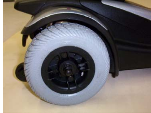
Rear Tire Solid/Foam-filled