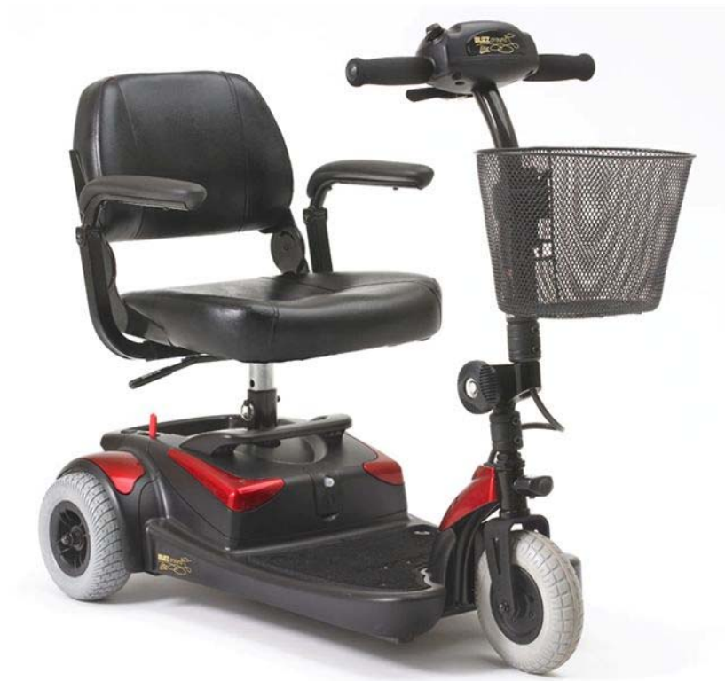
GB-106 and GB-106XR Buzzaround Lite™