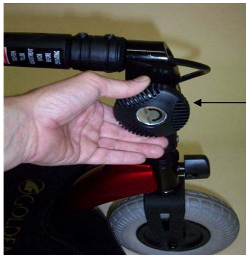
Tiller Adjustment Knob