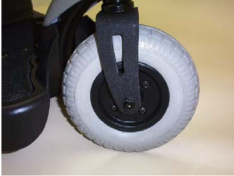
Front Tire Solid/Foam-filled

Your Buzzaround Lite™ scooter is equipped with “split-rim” wheels and foam-filled tires.