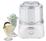
Ice Cream Makers

Cuisinart offers an extensive assortment of top quality products to make life in the kitchen easier than ever. Try some of our other countertop appliances and cookware, and Savor the Good Life™.